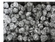
ALUMINIUM MESH SPHERES